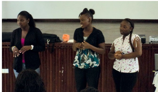
Pre-departure Orientation 2012.