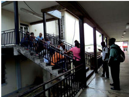
A collage of Barbados Community College events which took place in 2011-2012.